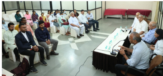
Optometry students at the orientation programme